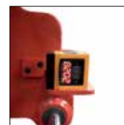
3 Depth load engagement sensors Detect type and configuration of the load in depth/height and the distance from the clamp body.