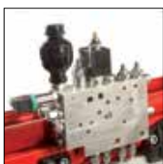
2 Proportional valve Commands the hydraulic pressure in the clamping cylinders.