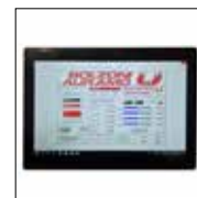
Set up Tablet Controls the parameters of the pressure configuration based on opening ranges.