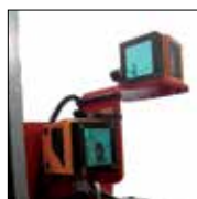
1 Laser detector Laser sensor for upper row to detect presence of boxes in the upper part of the pads.