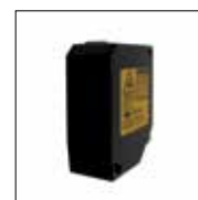
4 Opening laser sensor Detect the opening of the clamp and position of the arm